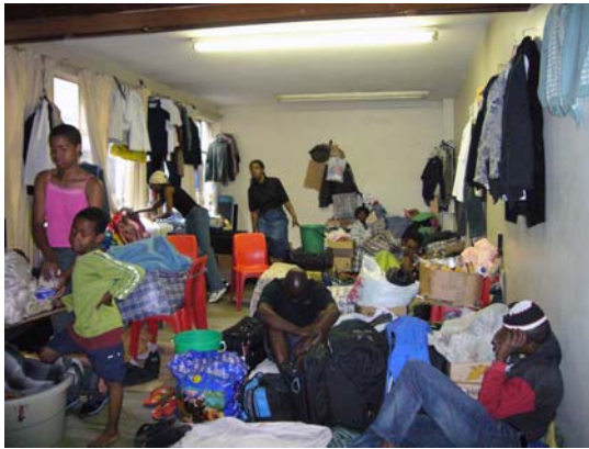
Refugees store their belongings in a room in the six-story downtown church.

That number is up from 900 during the first few months of 2007. Another 500 to 800 refugees can be found in the street immediately outside the building, according to Bishop Paul Verryn who leads the staff there.