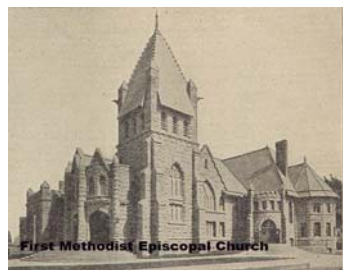
First Methodist Episcopal Church