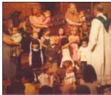
(right) Our Preschool sings joyfully, September 30, 2007

Here are John Wesley's directions for singing, from Select Hymns , published in 1761. These directions can be found in the current United Methodist Hymnal (page vii.)