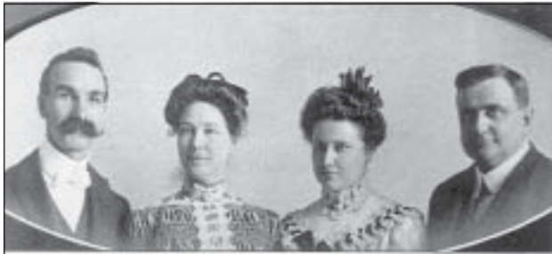
▲ Tabernacle Quartet, 1895-1900 ; the tenor and bass are also the town banker and dentist.