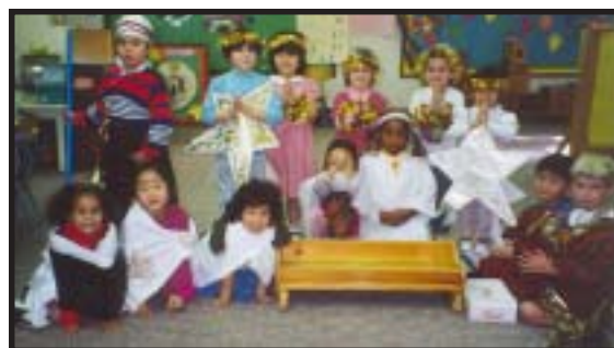
FUMC Preschool Christmas Pageant 1993