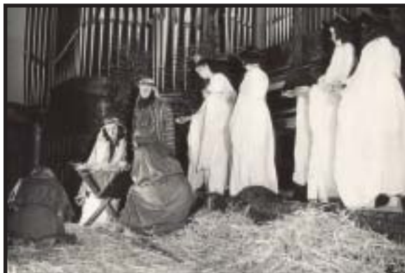
Christmas Pageant "The Holy Night" 1948

"...And she gave birth to her first-born son and wrapped him in swaddling clothes and laid him in a manger, because there was no place for them in the inn." Luke 2:7