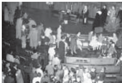
"White Gifts" Sunday: (L-R) Tissue-wrapped gifts surround the altar, 1926; youth line up for procession, 1956; end of White Gifts service, 1950s; Christmas pageant "The Holy Night," 1948; Youth un- wrapping gifts, 1955; Young musicians, 1956; Christmas tableau, 1950s; youth preparing to distribute food, 1955; kids await entrance, 1956; families place gifts on altar, 1954.

"White Gifts" Sunday was a very special family activity during the Christmas season. Cans of food, collected for the needy, were wrapped in white tissue paper, and presented at the altar.